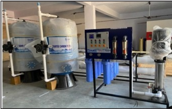
RO 10000 LPH@ Scinece City, A'bad